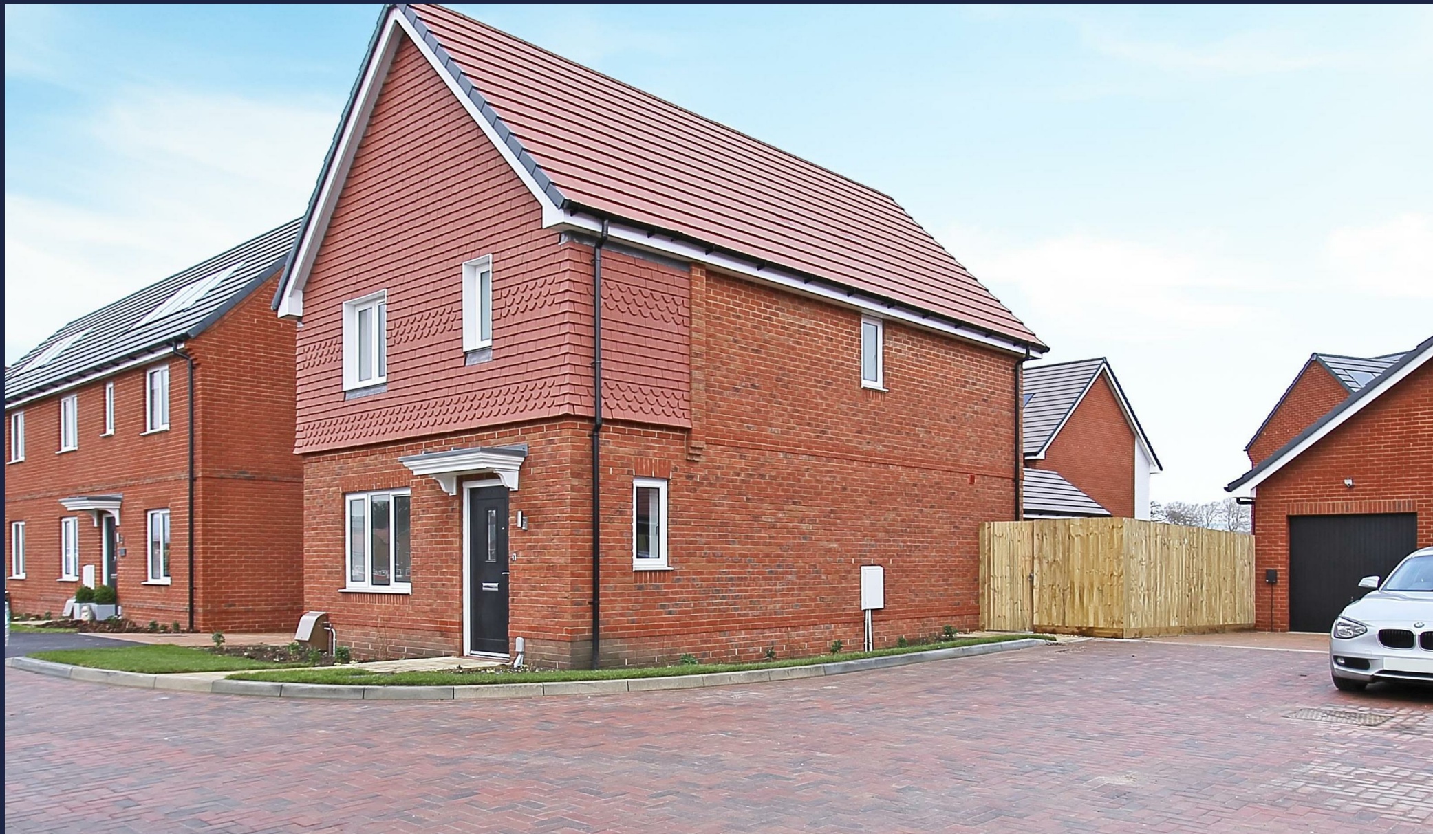
Lawrence Close, Salisbury